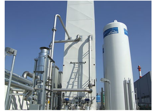
Distillation column in a cryogenic air separation plant

Pure gases can be separated from air by first cooling it until it liquefies, then selectively distilling the components at their various boiling temperatures. The process can produce high purity gases but is energy-intensive. This process was pioneered by Carl von Linde in the early 20th century and is still used today to produce high purity gases. He developed it in the year 1895; the process remained purely academic for seven years before it was used in industrial applications for the first time (1902). [2]